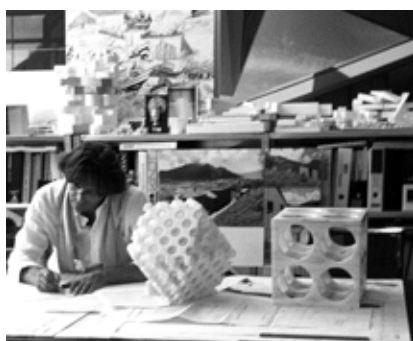
DAVIDE MACULLO ARCHITECTS